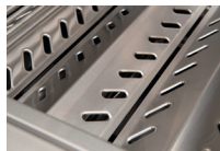
430 Grade Stainless Steel flame tamers